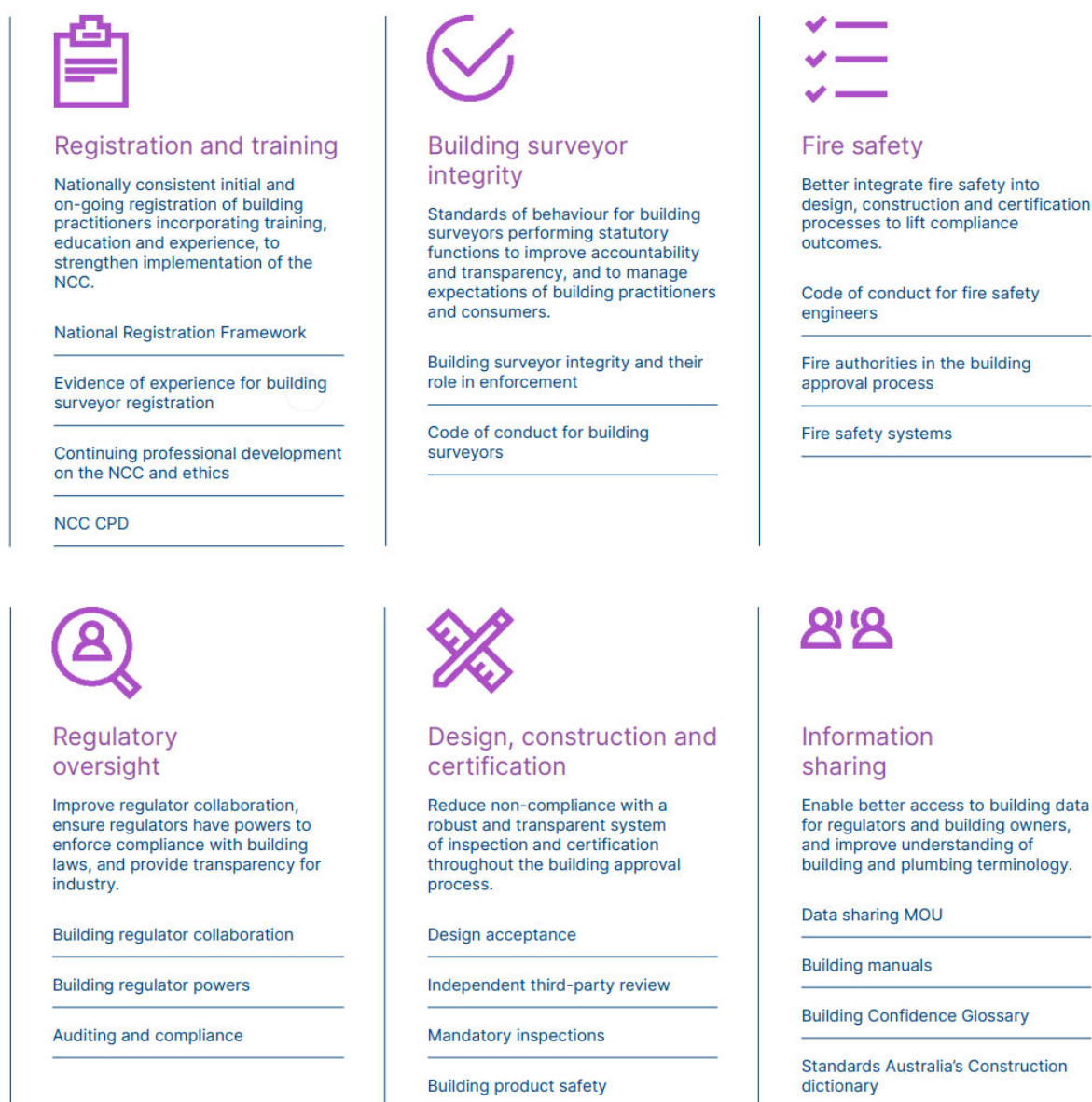
Figure 1 – Building Confidence Implementation Framework - Outputs